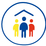
Return of Talent